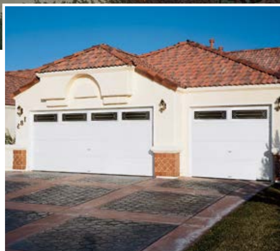
Model T41F, Modern Flush Panel with Optional Long Trillian Window Design