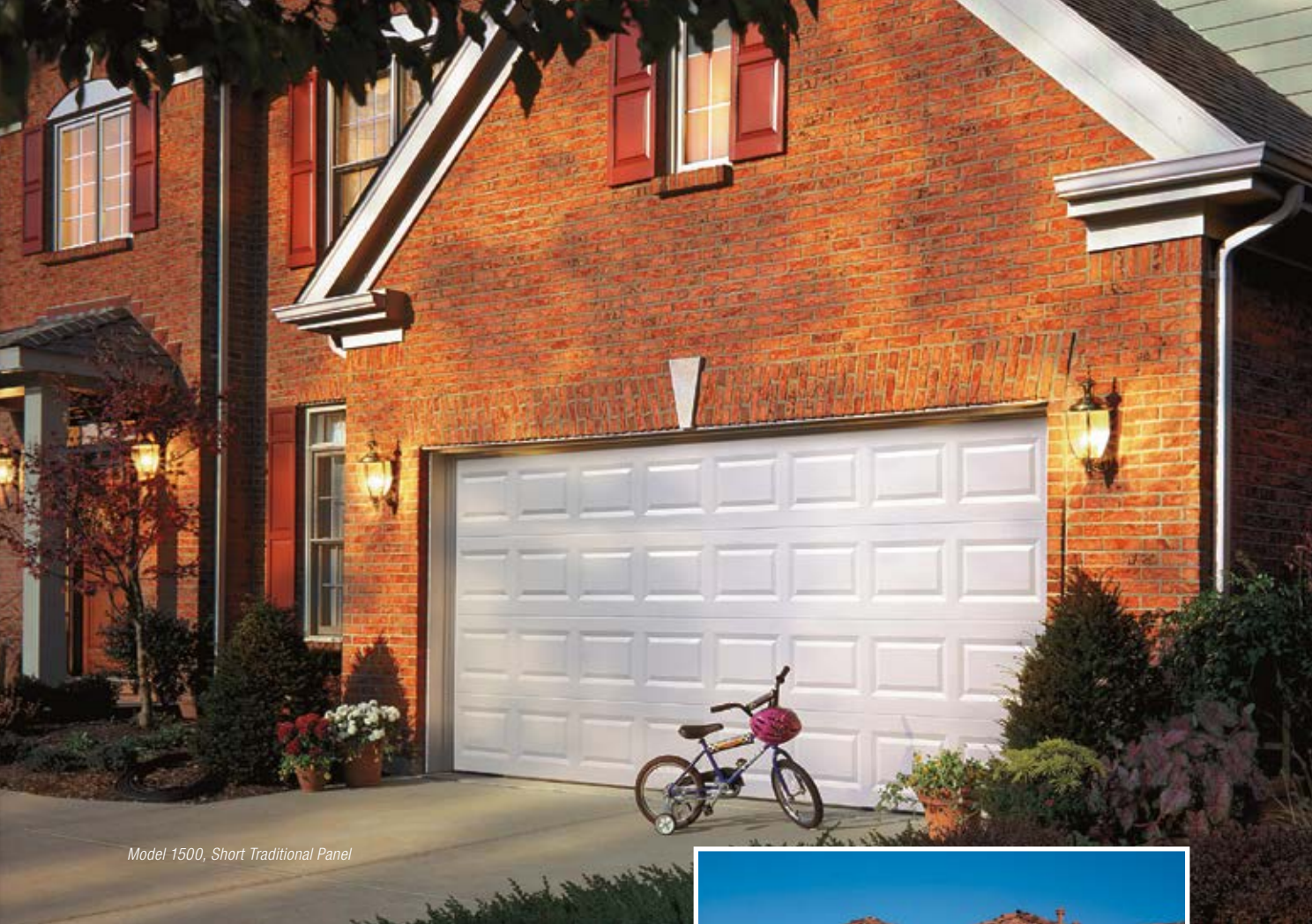
Model 1500, Short Traditional Panel