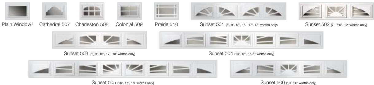
Plain Window† Cathedral 507 Charleston 508 Colonial 509 Prairie 510 Sunset 501 (8', 9', 12', 16', 17', 18' widths only) Sunset 502 (7', 7'6", 12' widths only) Sunset 503 (8', 9', 16', 17', 18' widths only) Sunset 504 (14', 15', 15'6" widths only) Sunset 505 (16', 17', 18' widths only) Sunset 506 (10', 20' widths only)