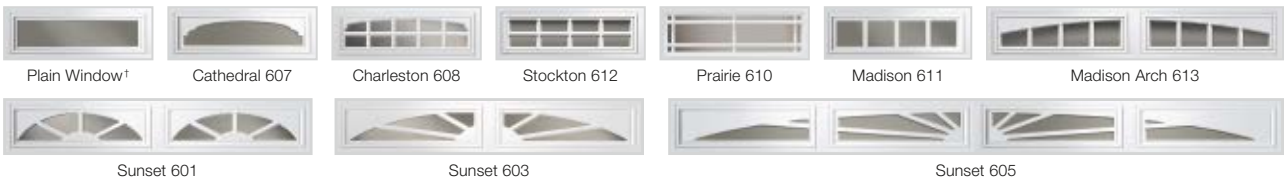
Plain Window† Cathedral 607 Charleston 608 Stockton 612 Prairie 610 Madison 611 Madison Arch 613 Sunset 601 Sunset 603 Sunset 605

* Panel emboss may not align on long window with short panels. Some size limitations apply.