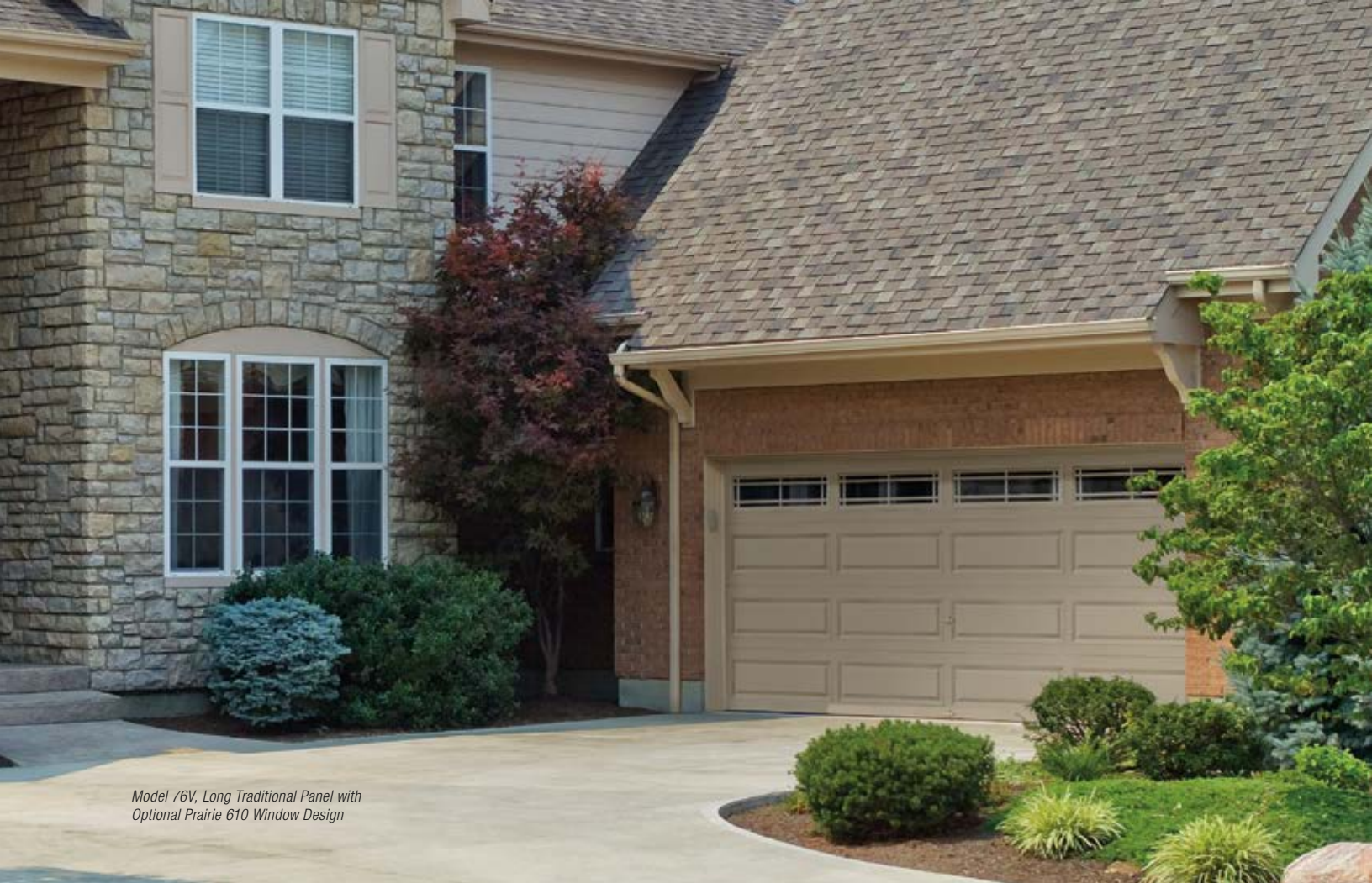
Model 76V, Long Traditional Panel with Optional Prairie 610 Window Design